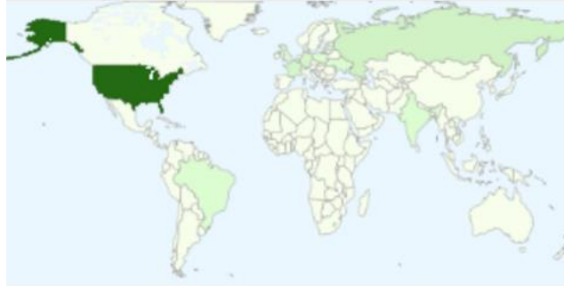
Figure 1 - Chronic Behavior LLC reach globally as of May 2017

WWFF will be utilizing its primary sponsor's demographics and reach to build and provide marketing exposure to the film festival. Our first year we received film submissions from 19 countries across the world. We are already on track for a greater reach for our 2019 event. Chronic Behavior LL has been in business for over six years and has specialized in support of the artists' community worldwide. They have an international business and demographics that have reach across the world.